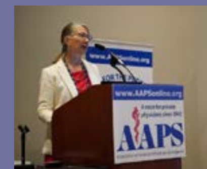
Explaining the New Framework at AAPS conference of physicians in MO