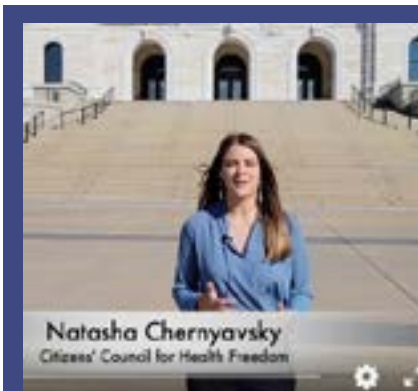
Natasha Chernyavsky in pre-election CCHF video: "Who is a 'Health Freedom' Candidate?"

As the election drew near, I produced a short CCHF video outlining five key issues citizens could use to better decide who would be more likely to defend health freedom and protect patient privacy. The video is available online: bit.ly/3gZabWI .