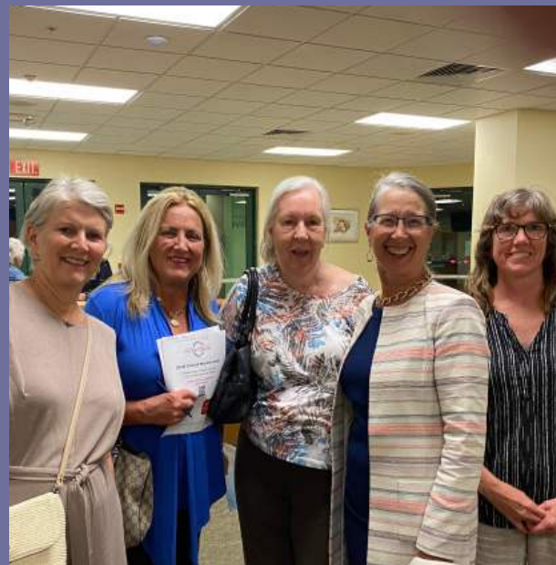
Speaking with some of the 200 attendees at the Covenant Life Church in Sarasota, FL