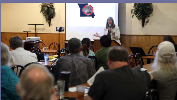
CCHF brings the message of a parallel system to "We the People" in Cape Girardeau, Missouri