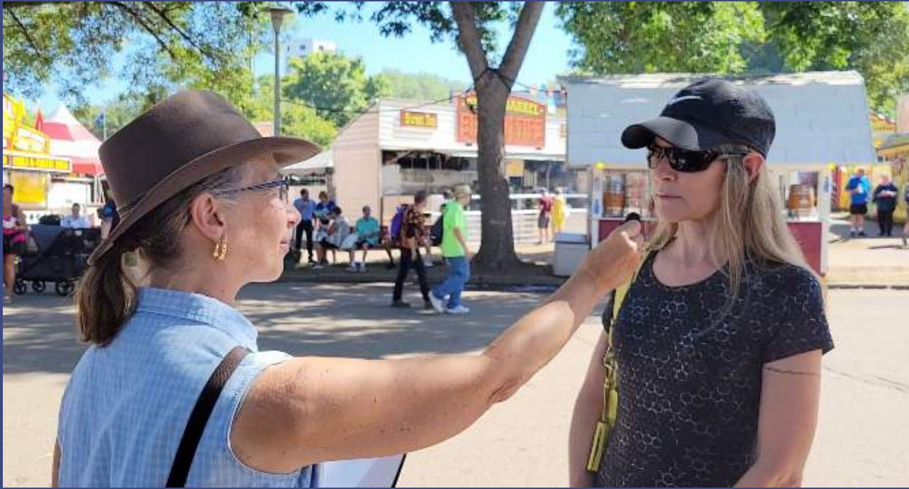
Conducting video interviews on HIPAA at the Minnesota State Fair