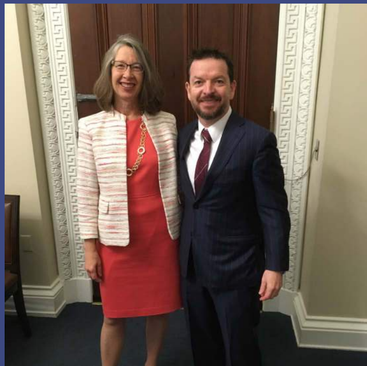
Twila Brase meets with Joe Grogan, Director of the White House Domestic Policy Council (DPC)

The U.S. Dept. of Health and Human Services where the Office for Civil Rights is located