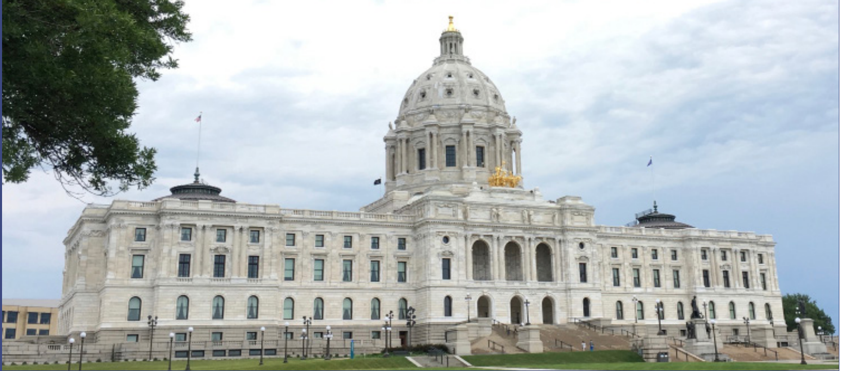
The Minnesota State Capitol building in St. Paul, MN