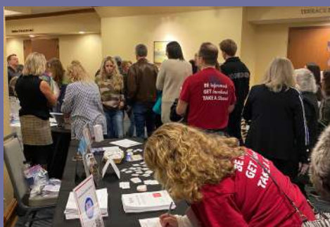
Attendees signing up for CCHF eNews