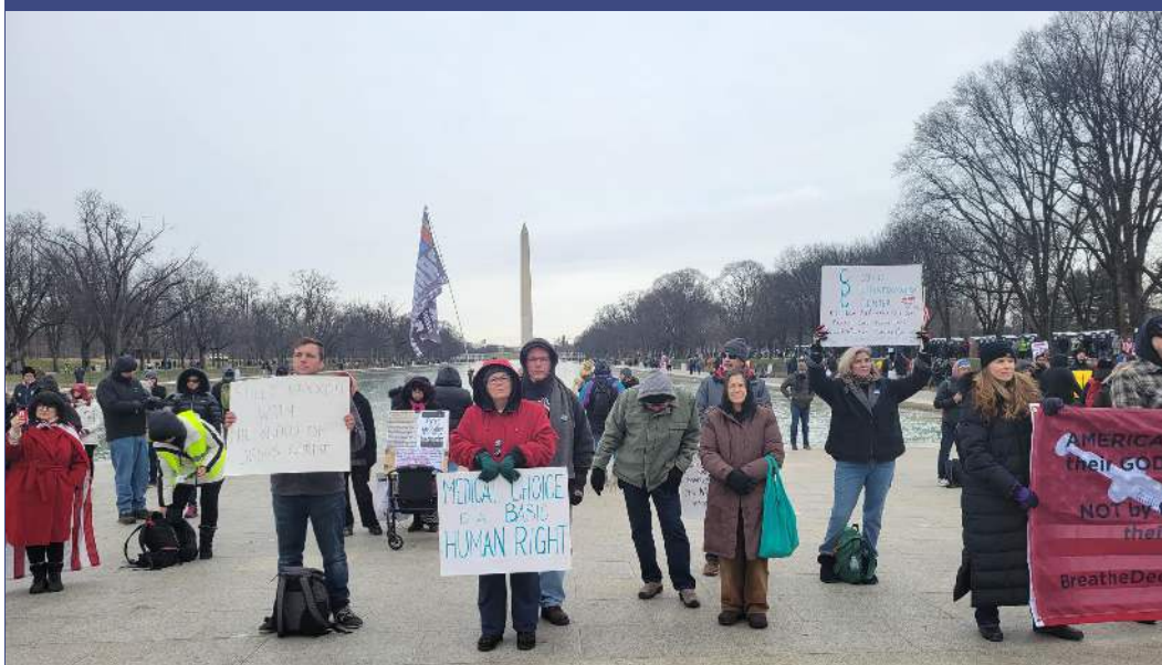
Patriots gathered January 23 in Washington, D.C. to show support for the Defeat the Mandates rally | Lincoln Memorial