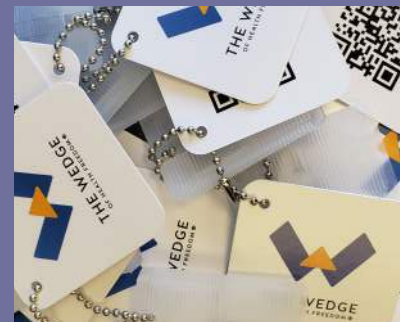
Our “Wobble Wedges” are a hit!