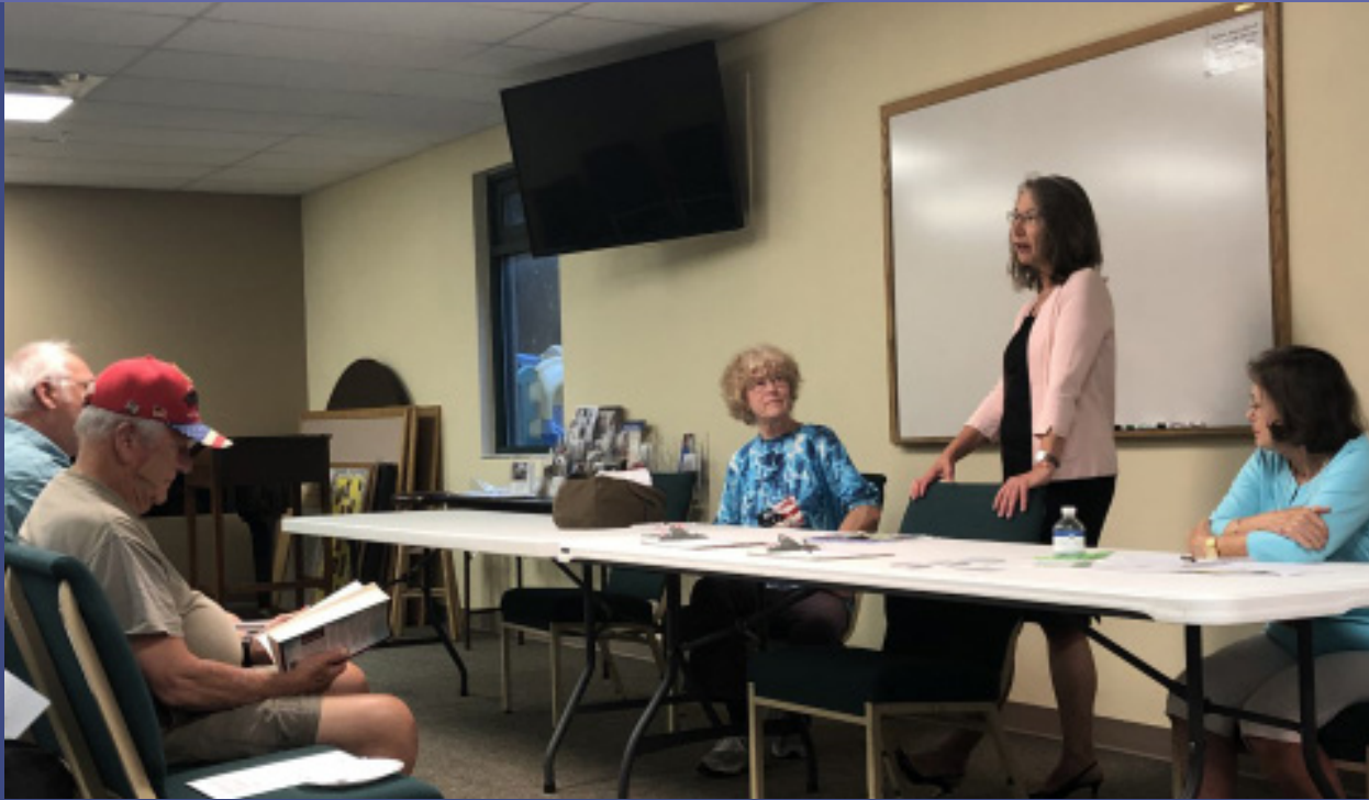
CCHF's President Speaks to Sarasota Patriots, Sarasota, Florida. August 2021