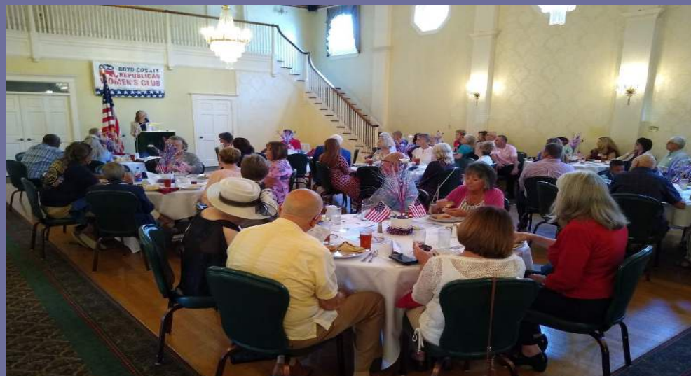
Boyd County Republican Womens Club in Ashland, Kentucky. June 2021