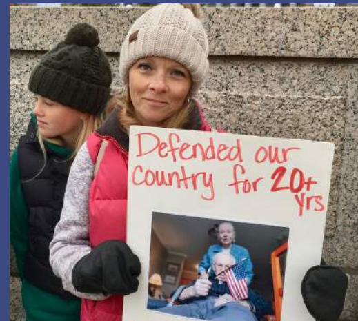
(Right): CCHF heard tragic stories of "Covid cruelty" and elder abuse at a MN rally - Find CCHF video about a 99-yr old woman on Facebook