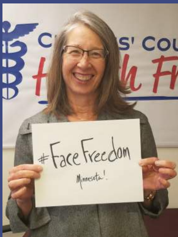
(Above): CCHF's President urges us all to "Be the Face of Freedom!"

Letters to State Officials: We've asked the MN Dept. of Health to provide data on the unauthorized Covid-19 hospital surveillance system and their Covid numbers. Our letter to the MN Board of Pharmacy counters their directive to pharmacists to decide whether to dispense hydroxychloroquine (HCQ) despite the Minnesota law that prohibits pharmacists from diverting from a physician's order. Stay tuned!