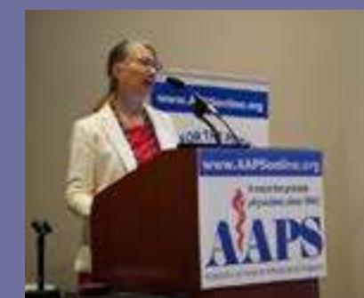
Explaining the New Framework at AAPS conference of physicians in MO