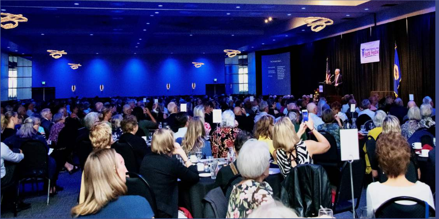
Dr. Scott W. Atlas, MD, speaking at CCHF's Annual Gala, September 9, 2021