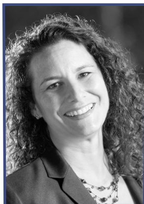
Special Projects Manager

I come into the role of Special Projects Manager with over 20 years professional experience in a variety of positions. Most recently, I was working for a large corporation in Chicago and am grateful to be coming back to my home state of Minnesota! I find it a great privilege that in my role, I will be able invest my time and talent to promote truthful information and make resources available for folks who want to preserve and protect their health privacy and freedom.