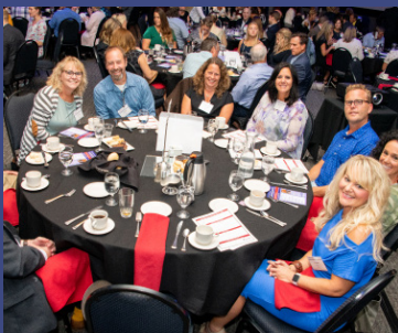
Attendees at our Gala enjoy an evening with friends—and no face masks.