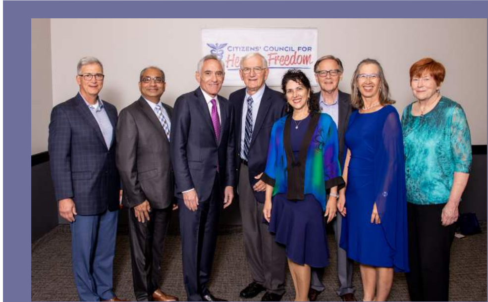
CCHF Board of Directors with Dr. Scott W. Atlas, MD

Thank you to everyone who attended and gave generously to support CCHF's freedom-focused work!